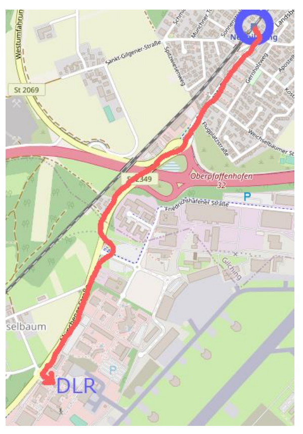
Figure 1: Walking direction from "Neugilching" S-Bahn station to DLR.

Herrsching/Oberpfaffenhofen/Wessling. After about 800 meters you will see the entrance to DLR on your left.