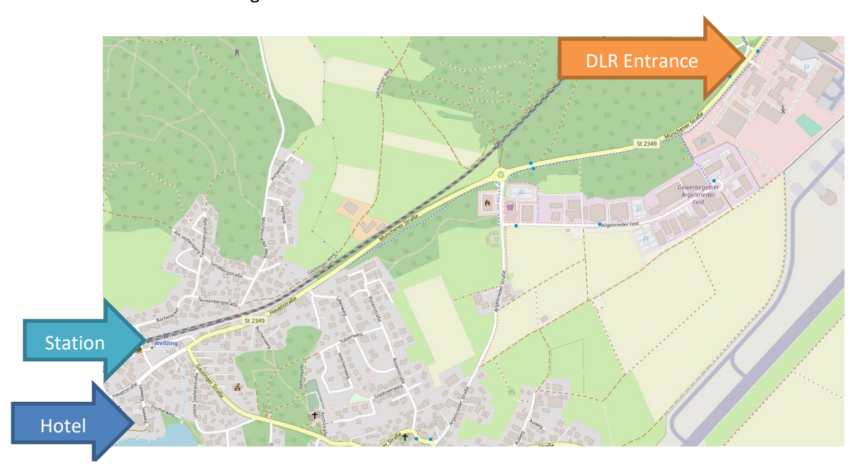
Figure 6: Map of Seehof Wessling Hotel (@OpenStreetMap)

The Seehof Wessling is also within walking distance of the DLR and close to the S-Bahn line 8. To get to DLR, walk down "Hauptstraße" or "Münchner Straße" and follow the sidewalk on the right. Outside the town, the path will take you through some woods next to the road. You will have to cross a roundabout before reaching the main entrance of DLR after about 20 minutes.