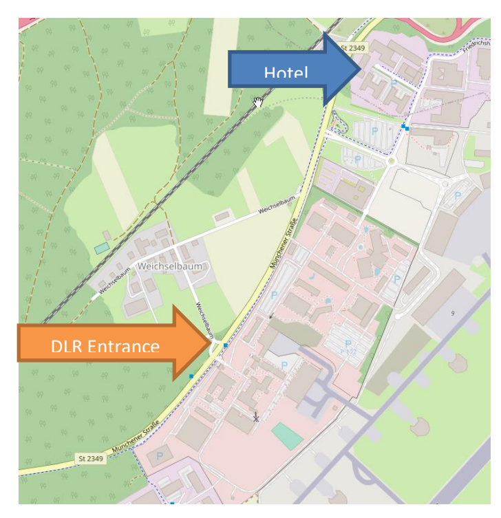
Figure 5: Map of Courtyard Oberpfaffenhofen

From the hotel it is just a 5 minutes walk to DLR. Follow the main road (Münchner Straße) to the DLR main Entrance.