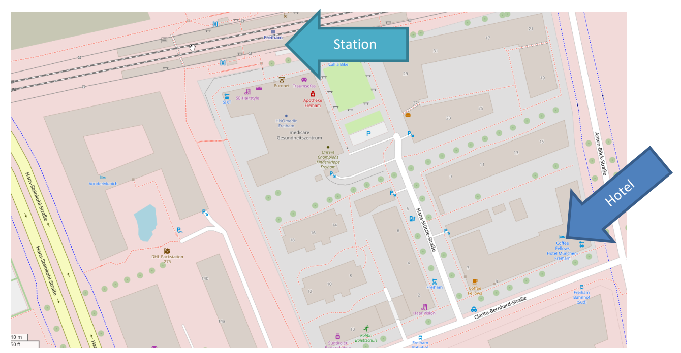
Figure 3: Map of Coffee-Fellow Hotel Freiham

The hotel is located directly on the S-Bahn line S8 between Munich city center and DLR. Freiham is an up-and coming new district of Munich, which was (and still is) built within in the last 5 years. Get off at "Freiham" station and walk. The entrance to the hotel is on Clarita-Bernhard-Straße.