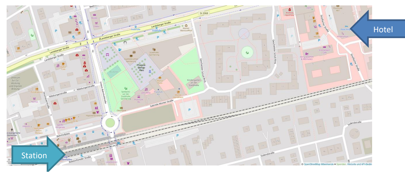
Figure 4: Map of Hotel Amper, Germering

The hotel is located in the city center of Germering, a city of about 40000 inhabitants between Munich and DLR. Restaurants and shops are nearby. It is a 5-10 minute walk from the S-Bahn station to the hotel.